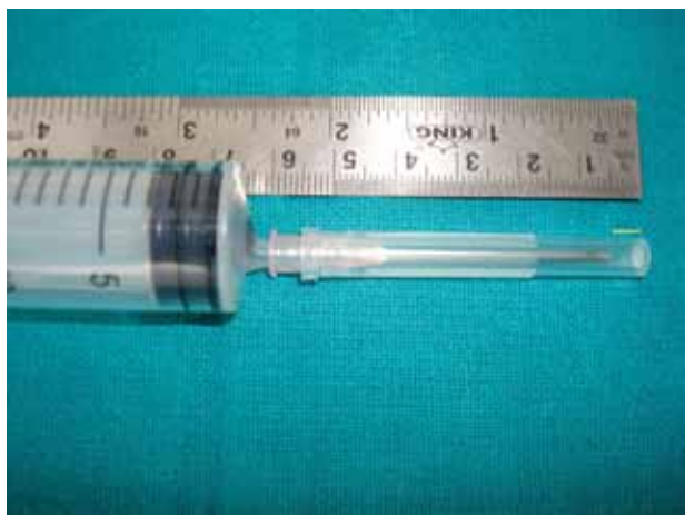
Figure 1: The cap of the needle is longer than the needle