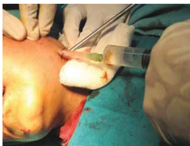
Figure 4: This syringe can be used for irrigation without any risk of needle stick injury