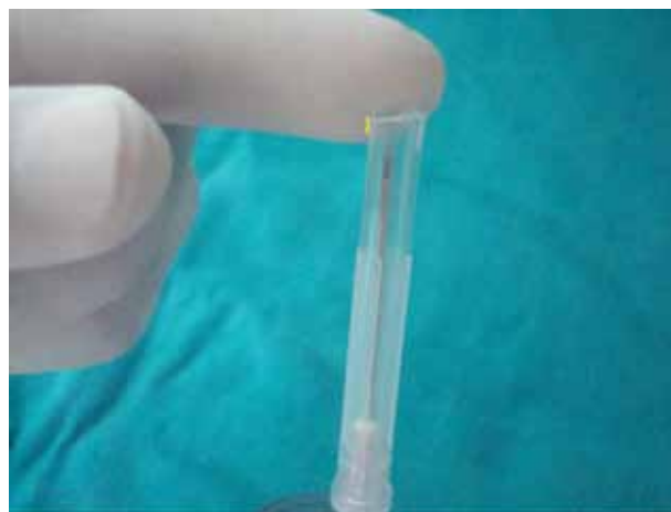
Figure 3: The remaining length of the cap still remains more than the needle by approximately 2mm