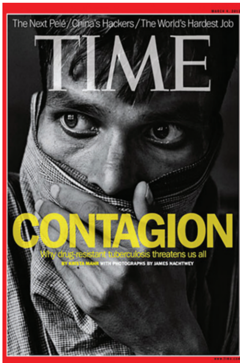
Fig. 2. In 2013, Time Magazine put drug-resistant tuberculosis on its front cover raising public awareness of this widespread threat to public health and to tuberculosis control programs. (Reproduced with permission.)

Indeed, in 2009 the World Health Assembly for the first time called explicitly for appropriate diagnosis and