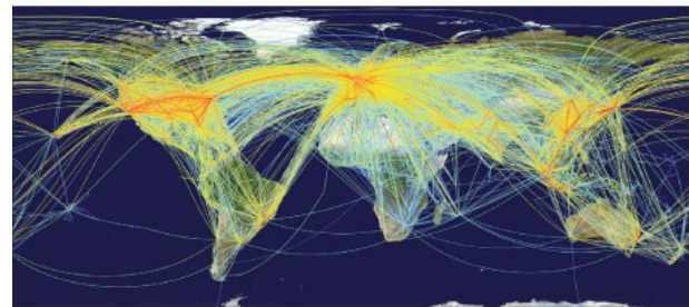
Figure 2. The global aviation network 18