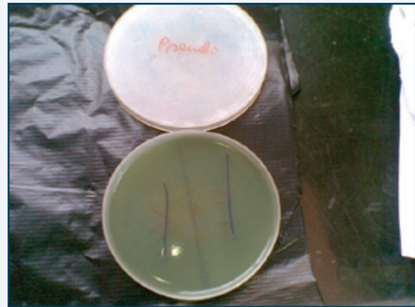
Figure 5. No zone of inhibition around coated and uncoated suture against Enterococcus and Pseudomonas spp.

(9.22%), Proteus (6.64%), Enterococcus (5.53%), Citrobacter (3.69%), and Acinetobacter spp. (2.95%).