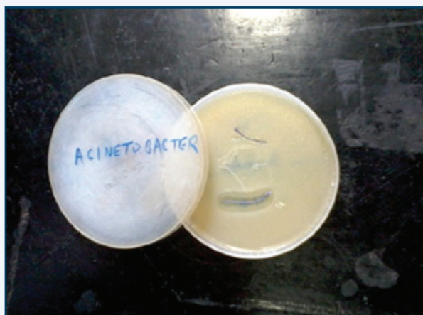
Figure 3. Good zone of inhibition around coated suture, no zone of inhibition around uncoated suture against Acinetobacter , E. coli and Klebsiella spp.