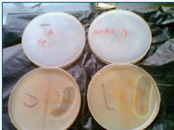
Figure 1. Good zone of inhibition around coated suture, no zone of inhibition around uncoated suture against S. aureus and CoNS