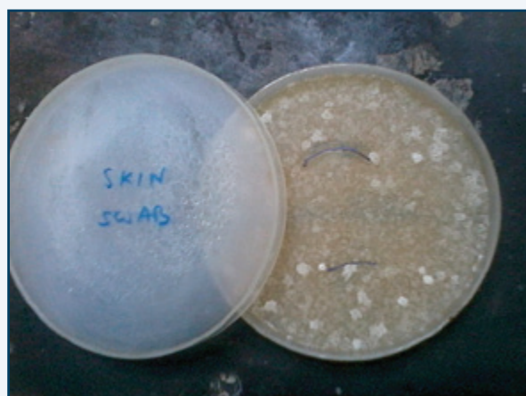
Figure 4. Good zone of inhibition around coated suture, no zone of inhibition around uncoated suture against Proteus and skin commensals