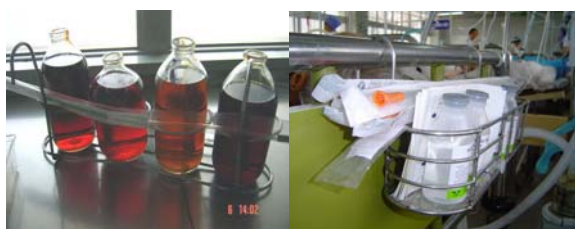
Before intervention After intervention