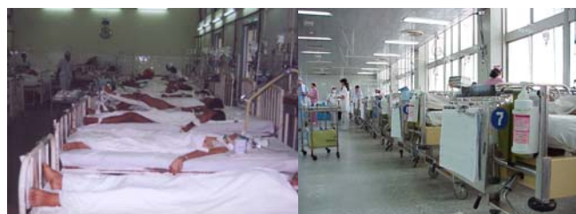
Before intervention After intervention