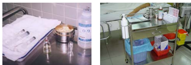
Before intervention After intervention