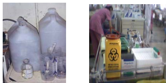
Before intervention After intervention